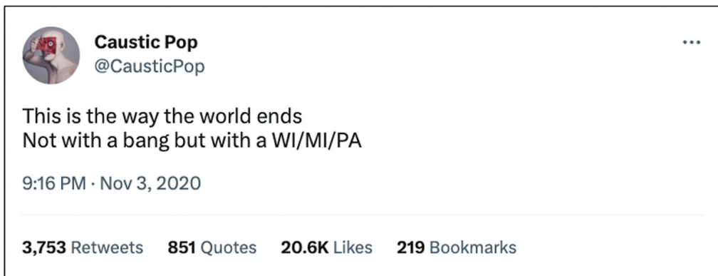
Figure 3.1 Twitter user Caustic Pop quips on the evening of the 2020 election: "This is the way the world ends / Not with a bang but with a WI/MI/PA." Twitter (X). November 3, 2020.

As early ballots rolled in, Twitter (X) users of all ideological stripes made fluctuating predictions about the election's outcome. When a few swing states seemed to tip toward Trump, a user named @CausticPop gloomily joked, "This is the way the world ends / Not with a bang but with a WI/MI/PA," 1 a joke that was retweeted more than 5,000 times. 2 Hours later, another user struck an even stronger chord with the same apocalyptic