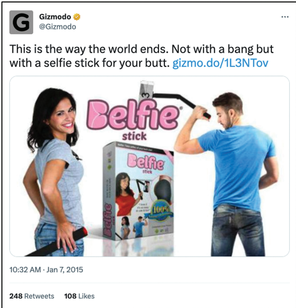
Figure 3.2 Design and technology website Gizmodo advertises a novelty product by repurposing Eliot’s lines: “This is the way the world ends. Not with a bang but with a selfie stick for your butt.” Twitter (X). January 7, 2015.

reveal,” “Not with a bang but with a selfie stick for your butt,” “Not with a bang but with a bunch of millennials who don’t know how to mail things.” 14