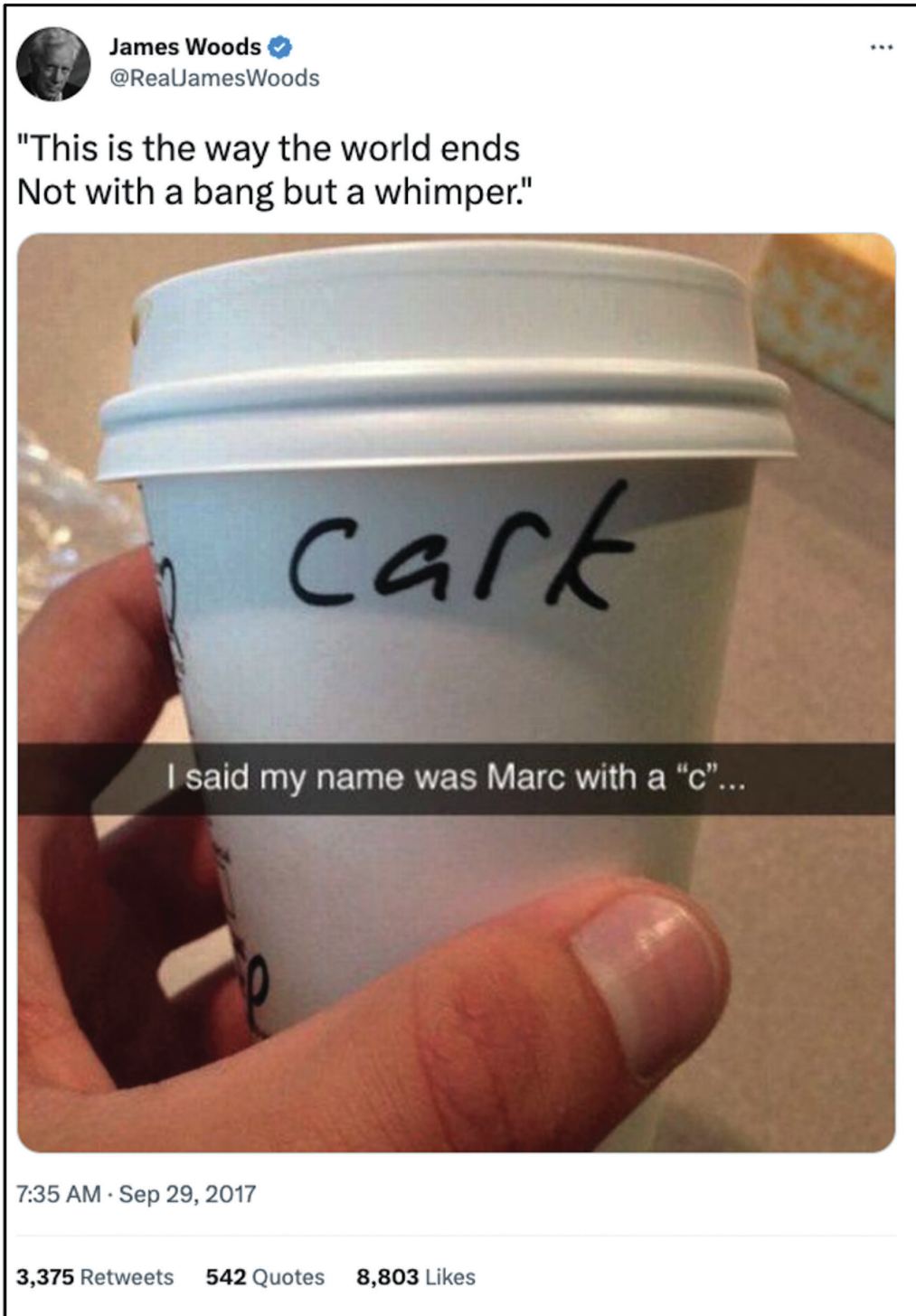
Figure 3.8 Actor James Woods uses Eliot's lines from "The Hollow Men" to caption a photograph of a Starbucks cup that says "Cark"—the result of a mistake by a Starbucks employee who had attempted to spell "Marc with a 'c.'" Twitter (X). September 29, 2017.