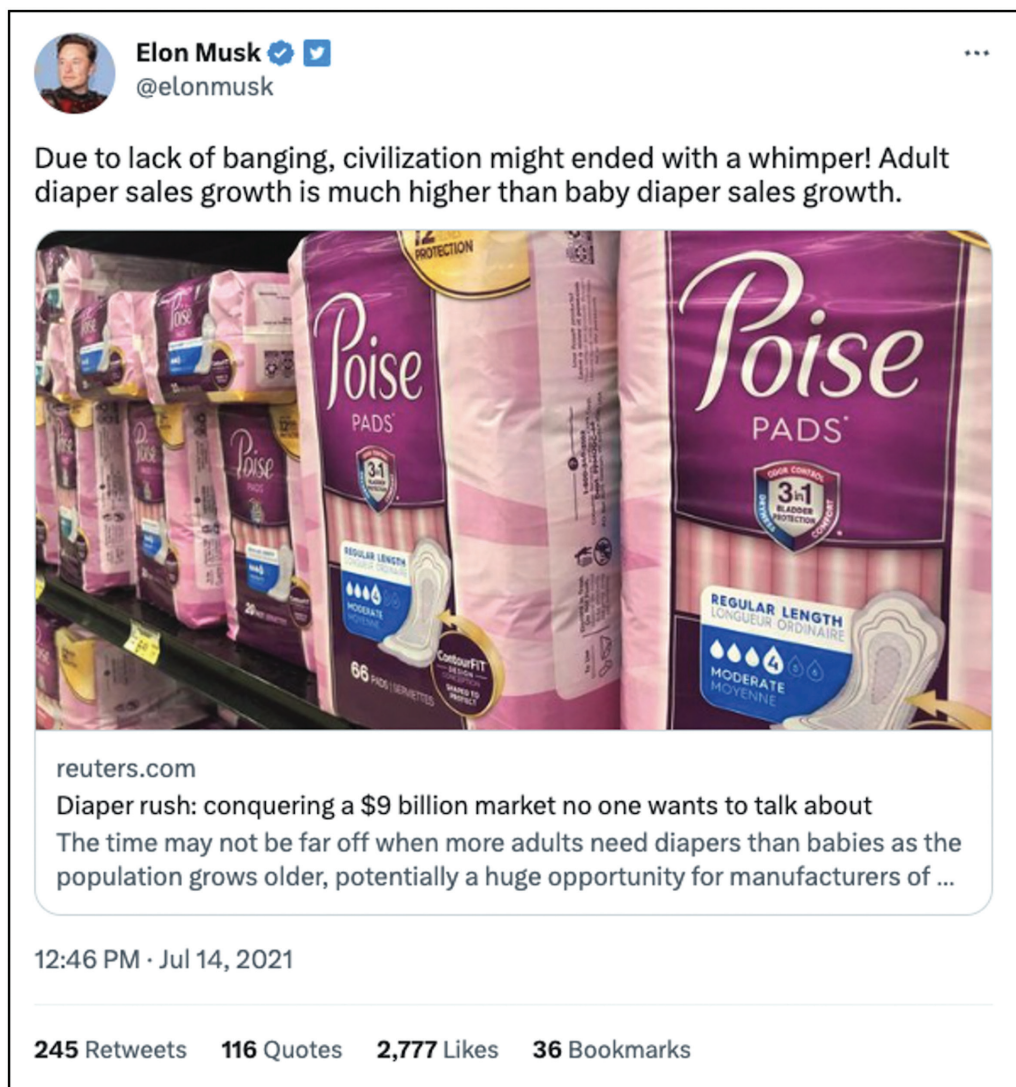
Figure 3.7 Future Twitter (X) owner Elon Musk jokes in response to a Reuters news item detailing the $9 billion market for adult diapers. Twitter (X). July 14, 2021.

CEO and, many would argue, its most prominent troll, this kind of use is further elevated. It is clear that Eliot's phrase can be made easily harmonious with sensationalizing, right-wing social media rhetoric.