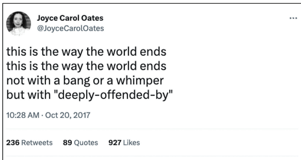
Figure 3.6 In this post, Twitter user and fiction writer Joyce Carol Oates uses Eliot’s lines to decry cultural-political oversensitivity: “this is the way the world ends / this is the way the world ends / not with a bang or a whimper / but with “deeply-offended-by.” Twitter (X). May 6, 2016.

literally dozens of times. In one revealing tweet, she explicitly stamped the phrase “deeply offended” with #CultureWar: “Why be only just ‘offended’ if you can be ‘deeply offended’? #CultureWar” 68 In another, she more specifically aligned the phrase “deeply offended” with the “young-left,” while also denigrating this group’s political ambition compared to older generations: “young activists of 1960s risked their lives for civil rights in Mississippi; young-left now searches for reasons to be ‘deeply offended’ in classrooms.” 69 In other cases, Oates directly connected the phrase to claims of racism and colonialism made by marginalized groups. After tweeting about the fact that certain sports mascots feel like “hate speech” to Indigenous communities, she replied to her own tweet and asked: “Yet, someone is likely to be ‘deeply offended’ by virtually anything. How to assess, adjudicate? What of ‘freedom’?” 70