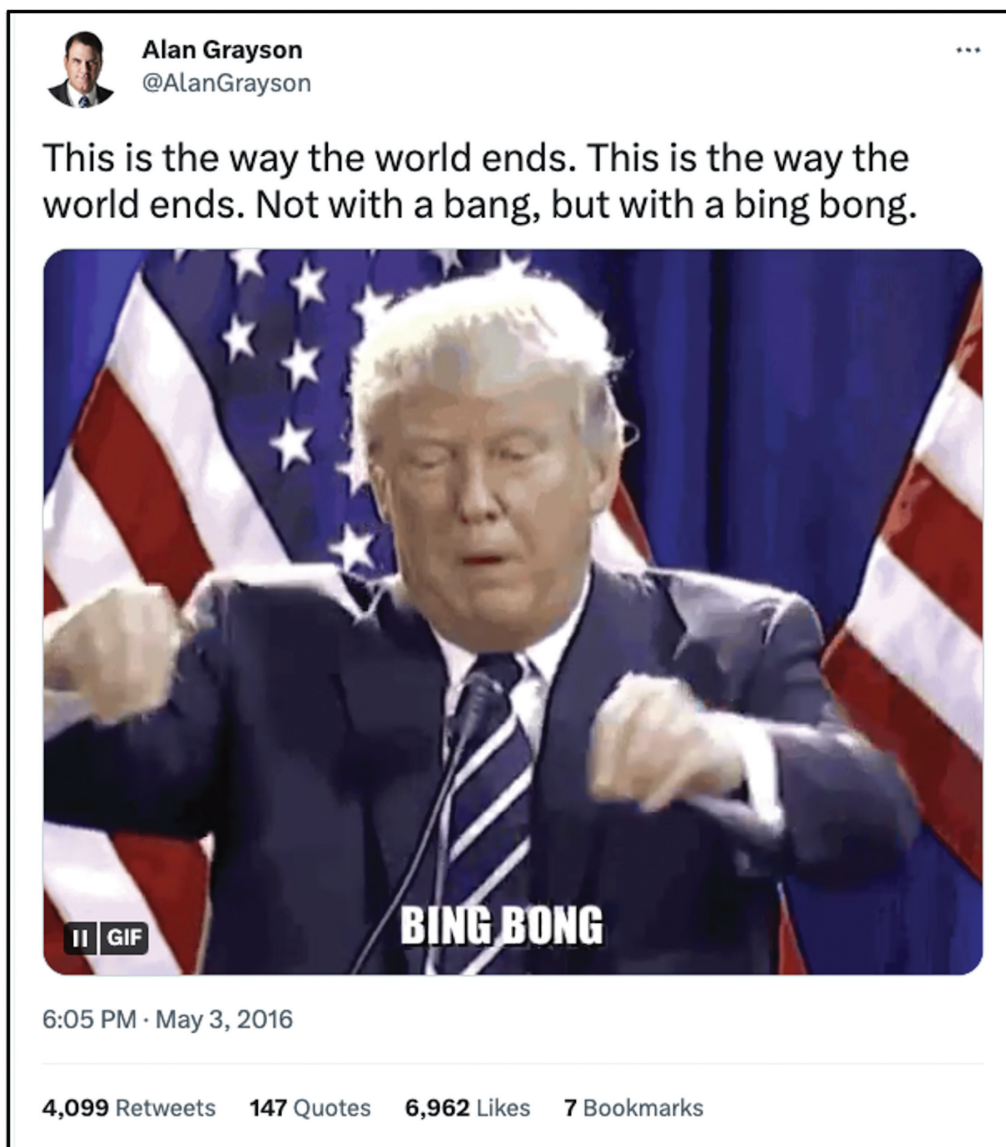
Figure 3.5 Twitter user and former Democratic Congressman Alan Grayson shares an image of Donald Trump saying “bing bong” along with this Eliot-inspired joke on the evening of the 2020 election: “This is the way the world ends. This is the way the world ends. Not with a bang, but with a bing bong.” Twitter (X). May 6, 2016.

users plugged into the lines' final syllables was a serious infraction, if still somehow a subtle one. For example, in December 2016, Twitter (X) user @hazydav shared a reimagining of Eliot's words above a split-screen image of Vladimir Putin and Trump speaking into cell phones, representing the leaders' November 2016 phone conversation and rumored alliance: "Apologies to TS Eliot ... this is how the Republic ends – not with a bang but a whisper..." 46 In other cases, "the whimper" was framed as something silly or ridiculous, and the